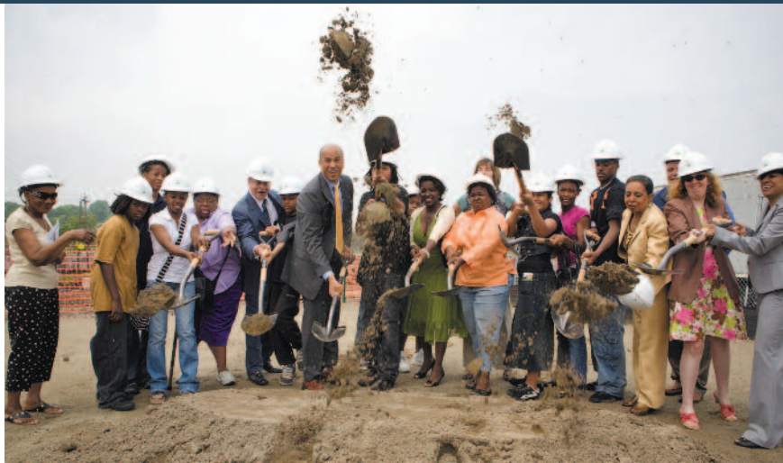
Mayor Cory Booker teamed up with the Apollo Alliance to create a roadmap for a healthy sustainable city.

In a clean energy economy powered by renewable and efficient sources, electricity can also be an important low-carbon fuel. Widespread use of plug-in electric vehicles will reduce America’s dependence on oil and the greenhouse